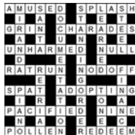
Crossword Solution from page 12

National Rail Enquiries 03457 48 49 50 Network West Midlands (buses) 0345 303 6760